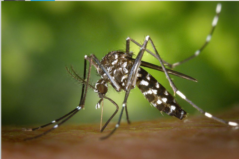
« Aedes » mosquito