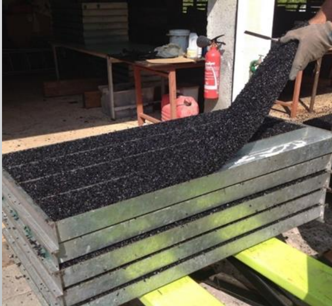
Blocks of AGLOSTIC are molded