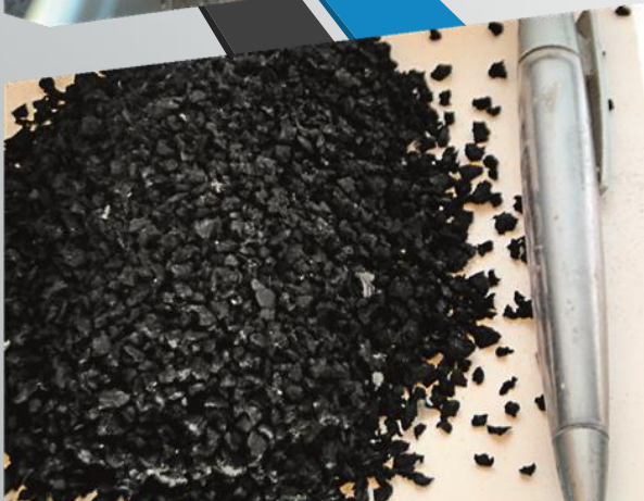
Recycled tires granulates